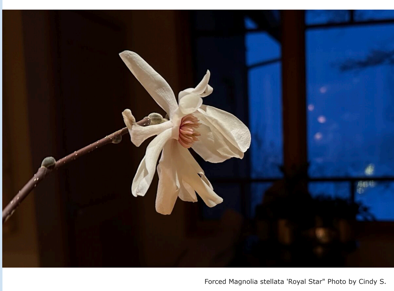
Forced Magnolia stellata 'Royal Star'